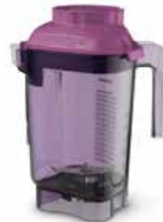
Advance® Purple Container 1.4 Litre