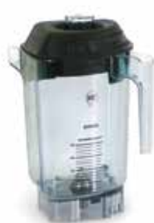
Advance® Container 0.9 Litre

One of the distinguishing features of the Vitamix range is that every container features double sealed bearings, where many of the competitive brands only feature one set of bearings. The advantage of double sealed bearings is that it runs cooler than single bearing containers and puts less load on the motor, enhancing machine life. Additionally, double bearings provide more rigidity and ensures the containers remain quiet over their lifetime, unlike other brands of containers with single bearings that become noisy over their lifetime.