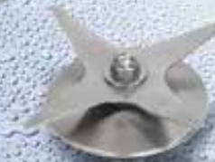
XL blade for 5.6 Ltr XL Container