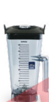
1.4 Litre Ice Container