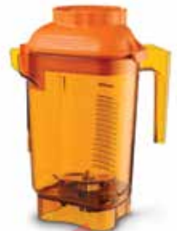
Advance® Orange Container 1.4 Litre