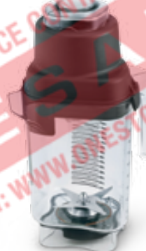
2.0 Litre XL Container