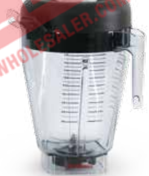
5.6 Litre XL Container