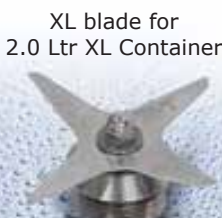
XL blade for 2.0 Ltr XL Container