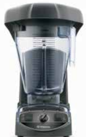
BEVERAGE BLENDER RANGE