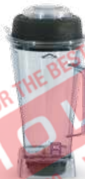
2.0 Litre Container