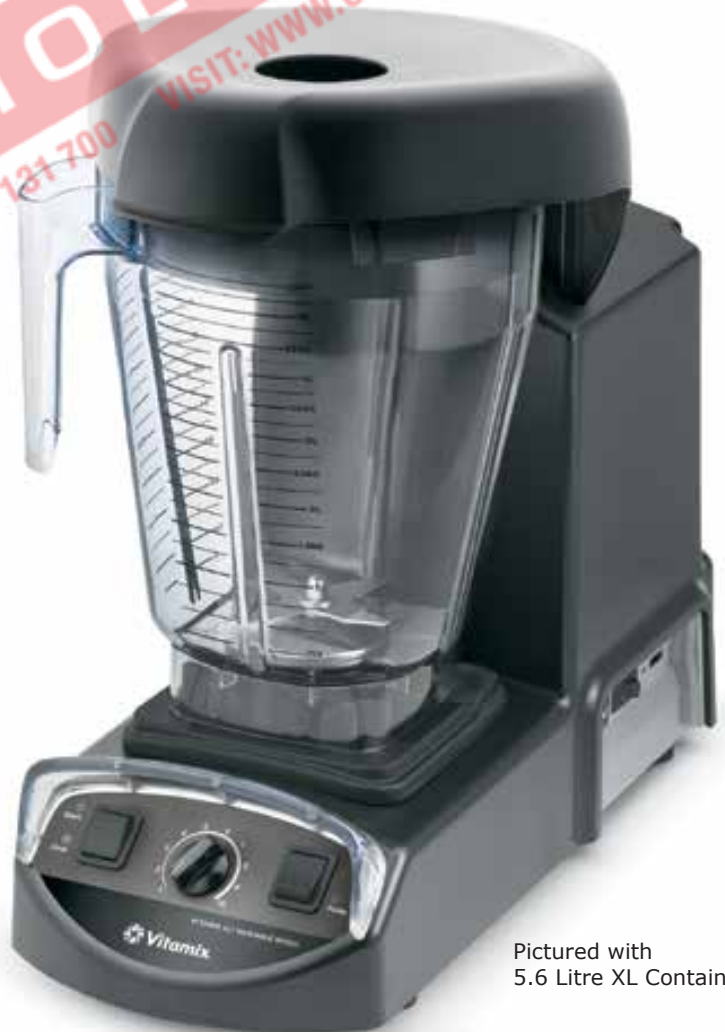
Pictured with 5.6 Litre XL Container