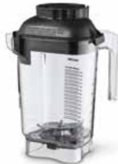
Advance® Container 1.4 Litre