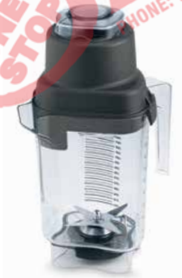
Optional 2.0 Litre XL Container

With its large capacity and ability to power through many types of foods, the Vitamix XL is an extremely valuable addition to kitchens in nursing homes, hospitals, retirement centres, schools, colleges and universities - the perfect tool for satisfying large groups of people!