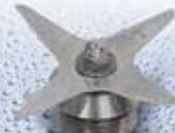
XL blade for 2.0 Ltr XL Container