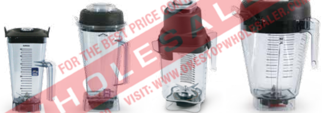
1.4 Litre Ice Container