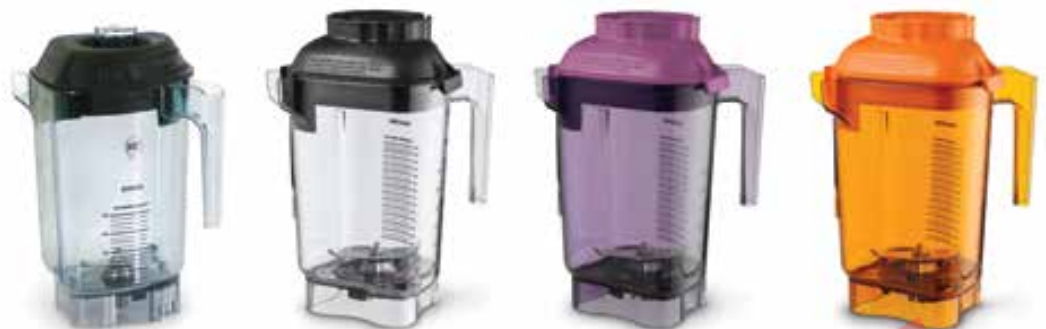
Advance® Container 0.9 Litre

One of the distinguishing features of the Vitamix range is that every container features double sealed bearings, where many of the competitive brands only feature one set of bearings. The advantage of double sealed bearings is that it runs cooler than single bearing containers and puts less load on the motor, enhancing machine life. Additionally, double bearings provide more rigidity and ensures the containers remain quiet over their lifetime, unlike other brands of containers with single bearings that become noisy over their lifetime.