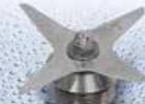
XL blade for 2.0 Ltr XL Container