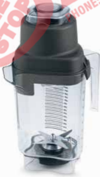
Optional 2.0 Litre XL Container

With its large capacity and ability to power through many types of foods, the Vitamix XL is an extremely valuable addition to kitchens in nursing homes, hospitals, retirement centres, schools, colleges and universities - the perfect tool for satisfying large groups of people!