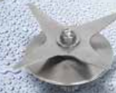
XL blade for 5.6 Ltr XL Container