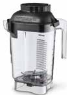
Advance® Container 1.4 Litre