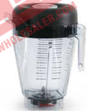
5.6 Litre XL Container