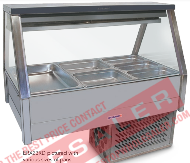
ERX23RD pictured with various sizes of pans

See pages 40 - 42 for all optional accessories.