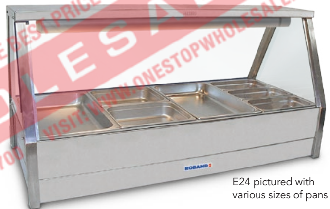
E24 pictured with various sizes of pans