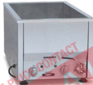
BM21 pictured. (narrow footprint)