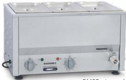
BM2B pictured. (wide footprint)