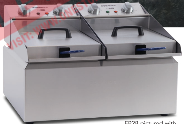
FR28 pictured with pan covers